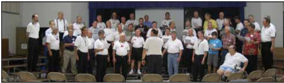
Summit City Chorus with Guests