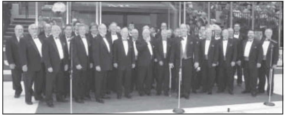
The Summit City Chorus sings on the ice before the Komet hockey game.

During the chorus's pre-game singing, I'm sure SCC members noticed a photographer taking pictures of the chorus in the lobby